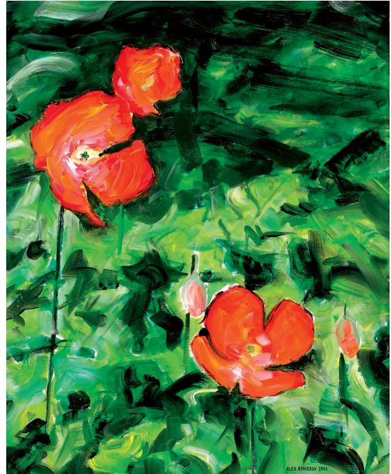
Red Poppy , Oil on canvas, 2004. 40.5 x 50.5 cm