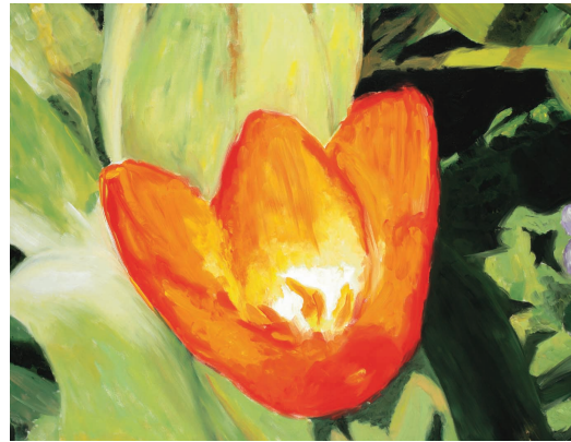
Red tulip , Oil on canvas, 2002. 90 x 70 cm