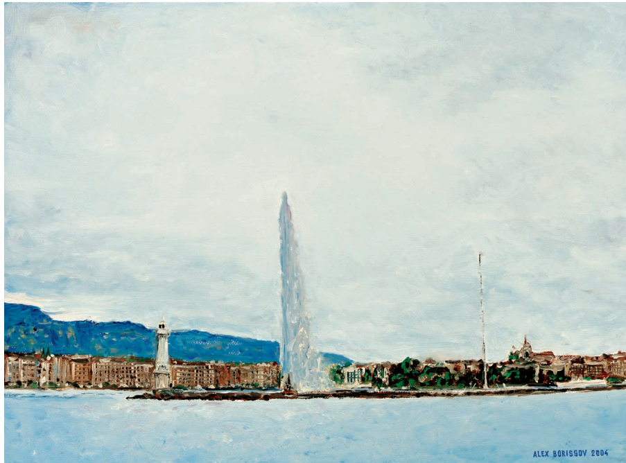
Geneva Landscape , Oil on canvas, 2004. 40.5 x 30.5 cm