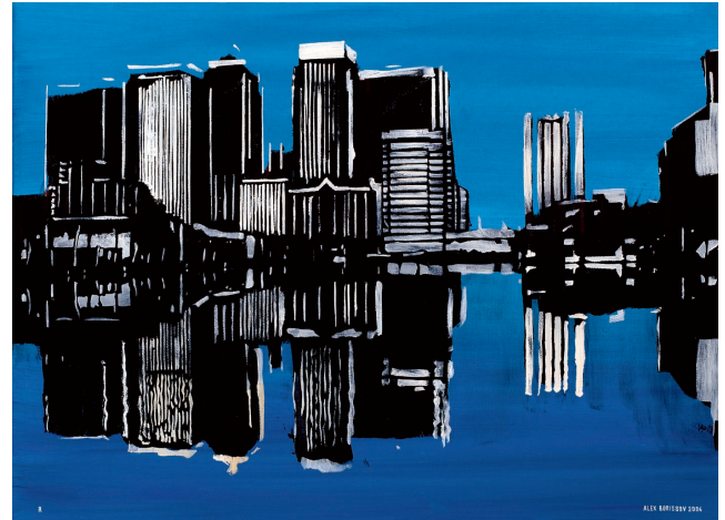
Canary Wharf Landscape , Oil on canvas, 2004. 60 x 40.5 cm

For more information please visit www.eulerhermes.com/uk or call 0800 056 5452.