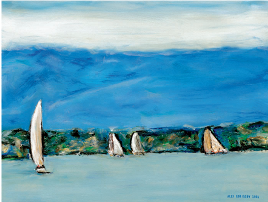
Sails , Oil on canvas, 2004. 40.5 x 30.5 cm