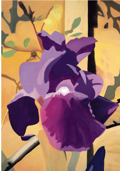
Iris , Oil on canvas, 2002. 70 x 100 cm