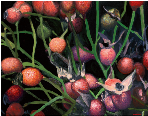
Commuters , Oil on canvas, 2003. 90 x 70 cm