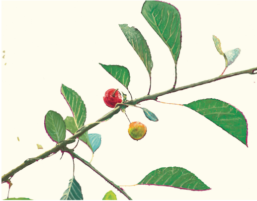
Cherries , Oil on canvas, 2002. 90 x 70 cm