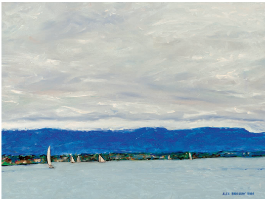
Geneva Boat Racing , Oil on canvas, 2004. 40.5 x 30.5 cm