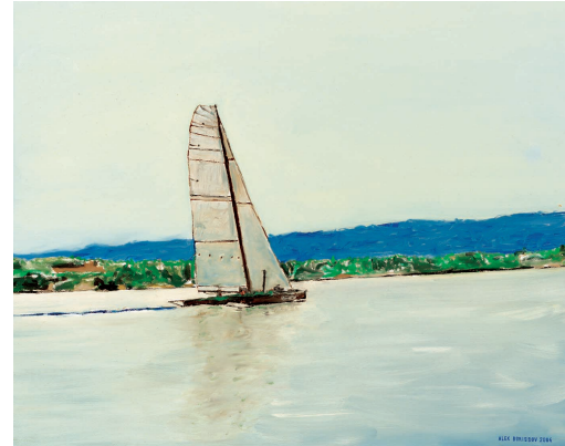
Racing Boat One , Oil on canvas, 2004. 51 x 40.5 cm