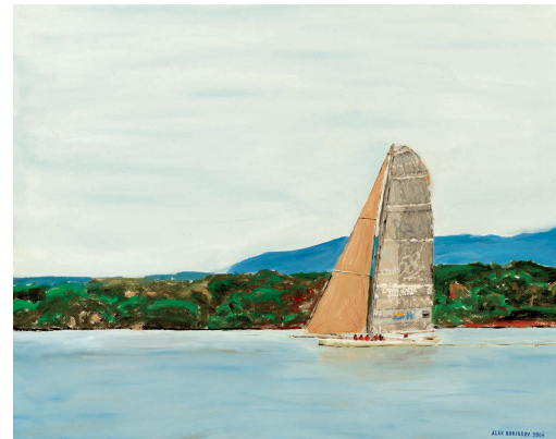
Club 58 , Oil on canvas, 2004. 51 x 40.5 cm